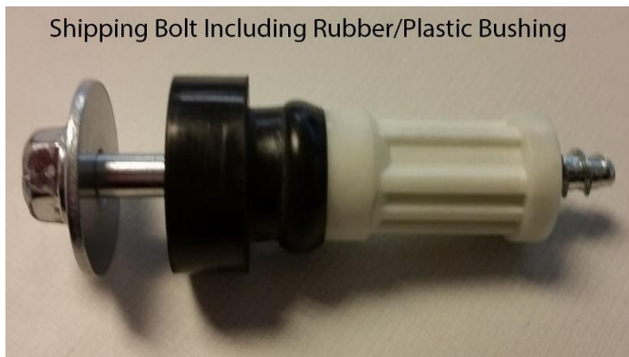
Shipping Bolt Including Rubber/Plastic Bushing